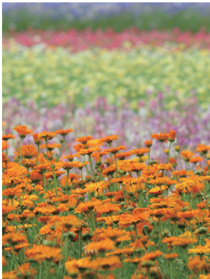
盛夏的花田 Colorful flower field in midsummer