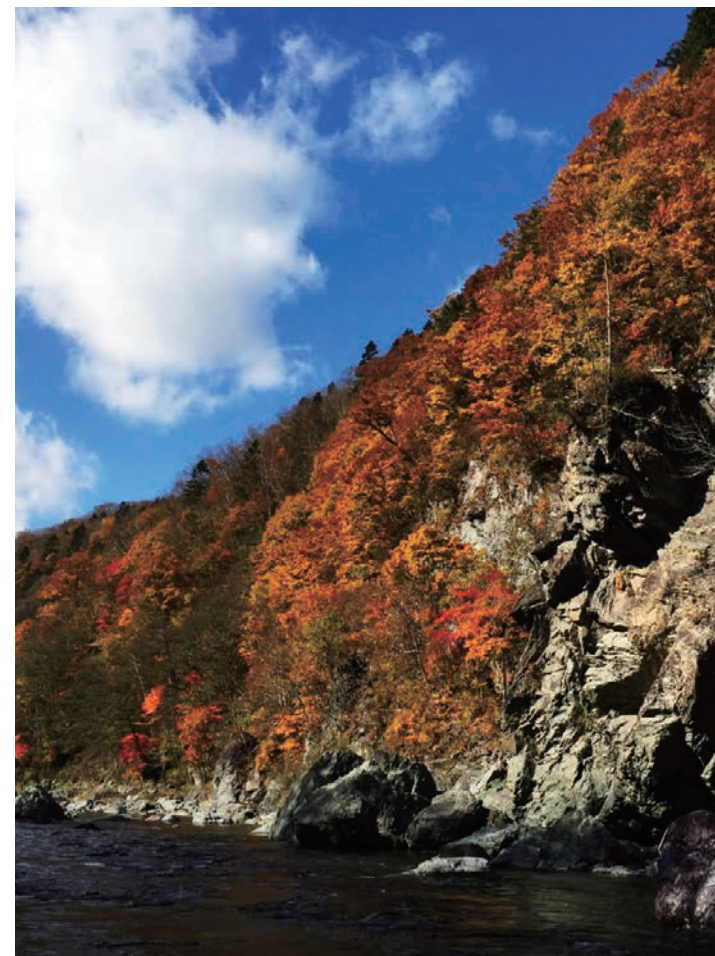
赤岩青巖峽 Akaiwa Seigankyo Gorge