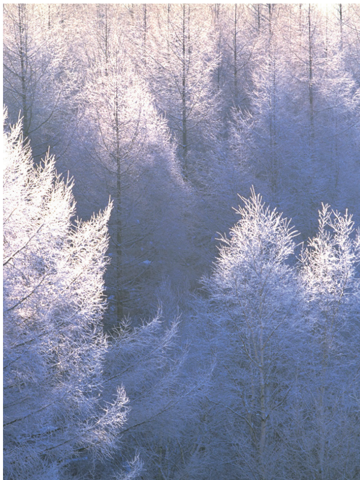
严冬的树林 Trees in severe winter