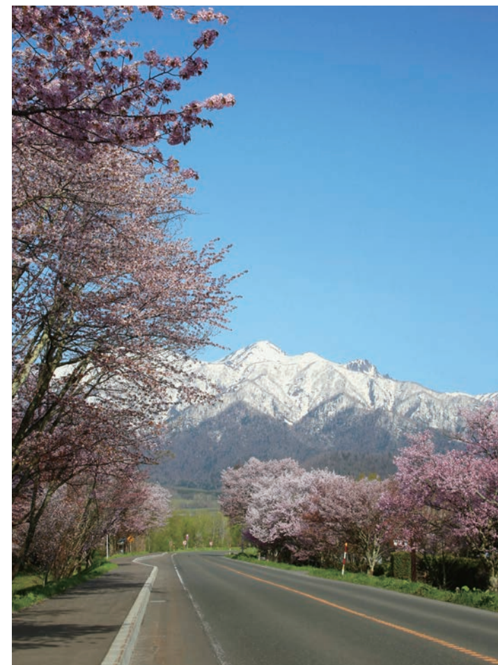
残雪与樱花 Long-lying snow patches on mountains and cherry blossoms